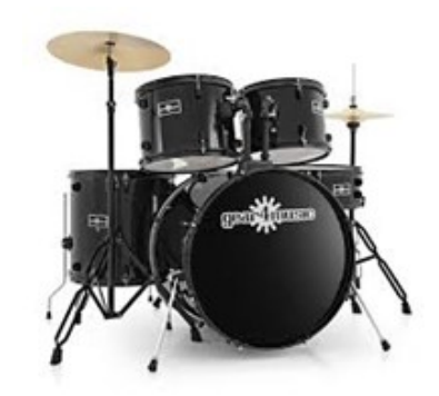
Term 2 - Drumming Lessons starting at Belvoir