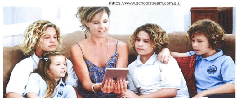
Free for parents, students and staff of registered schools

How to get the school stream app on your mobile device