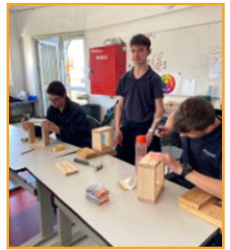
Curtis Room 19