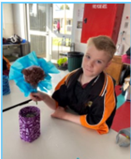
Max Room 9